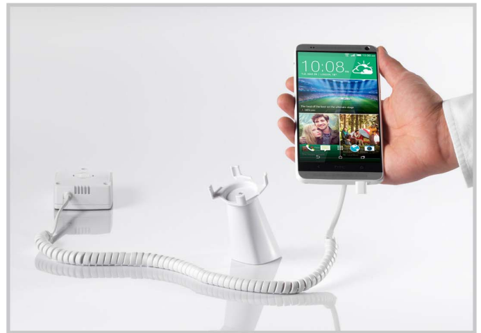
Power w/ Screamer Sensor