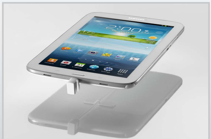
180° Micro USB Sensor