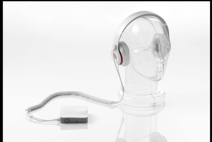
Mini-disc Sensor w/Audio