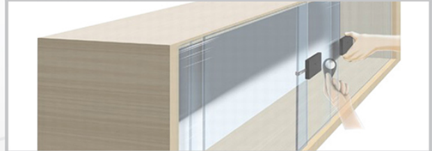
RFID Access via key or fob