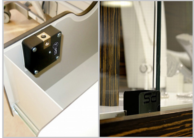
Low-profile locks fit in fixtures with minimal footprint