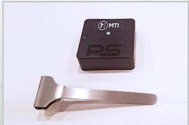
Thin Glass Door Lock Kit